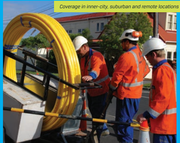
Coverage in inner-city, suburban and remote locations

We have an impressive record managing callouts from the public or responding to faults detected by employees on site. Our ability to mobilise our workforce quickly enables us to respond to requests on demand, even with the effects of seasonal variation.