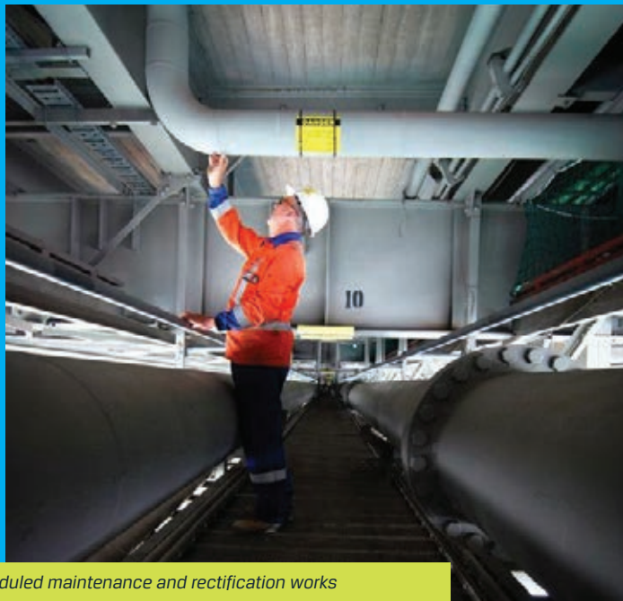
Scheduled maintenance and rectification works

We have developed technology to allow data from volume inspections to be gathered via PDAs improving efficiency by allowing employees to directly manage faults at the site. The system also reduces the errors associated with manual handling, improves service levels, allows data to be easily entered in customers' CRM systems, makes analysis simpler, and provides for regulatory compliance requirements.