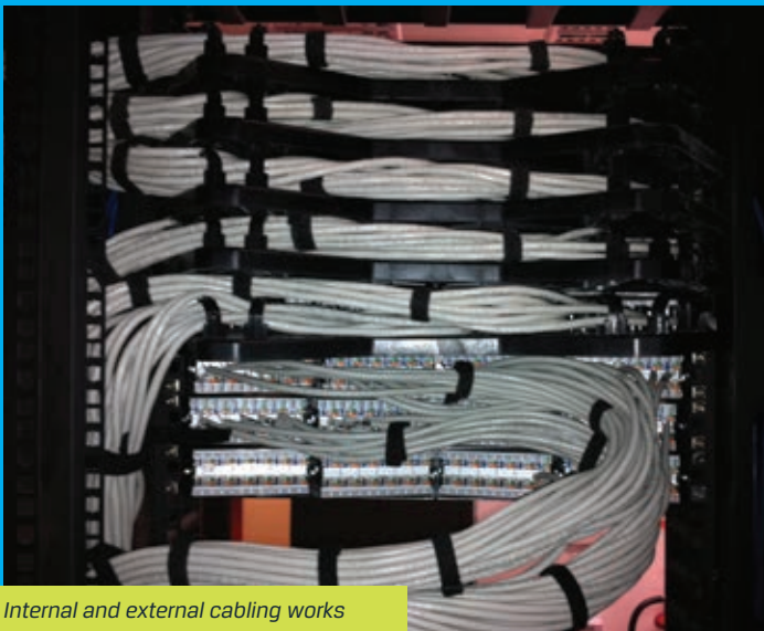
Internal and external cabling works