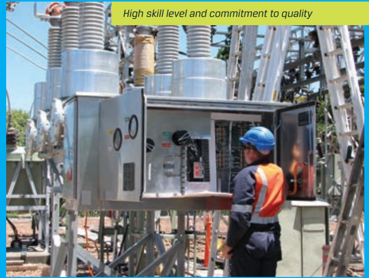
High skill level and commitment to quality

With full geographic coverage across both Australia and New Zealand we are able to deliver a complete range of services to our customer base.