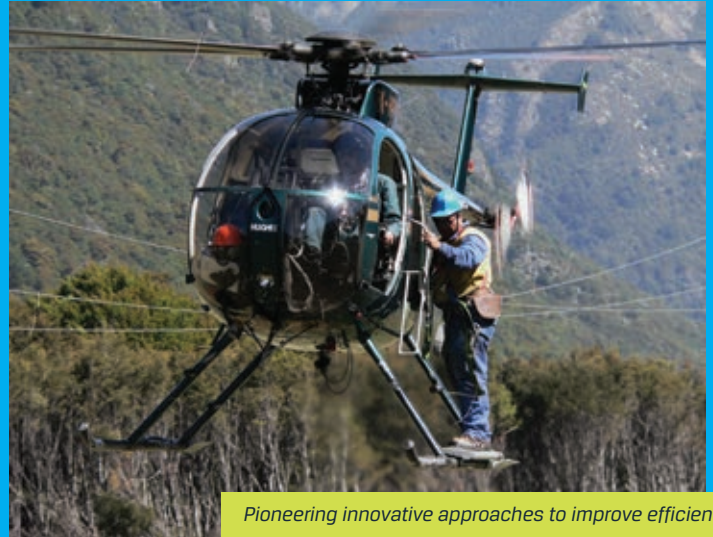
Pioneering innovative approaches to improve efficiency

Safety is paramount across our operations. We have a high focus on safety and place significant importance on initial and ongoing training for our large workforce. Intensive planning and risk management processes ensure we can meet the challenges of working in extreme weather conditions, in environmentally sensitive areas, within tight time frames to deliver a safe and high quality outcome.