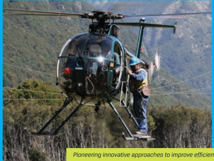
Pioneering innovative approaches to improve efficiency

Safety is paramount across our operations. We have a high focus on safety and place significant importance on initial and ongoing training for our large workforce. Intensive planning and risk management processes ensure we can meet the challenges of working in extreme weather conditions, in environmentally sensitive areas, within tight time frames to deliver a safe and high quality outcome.