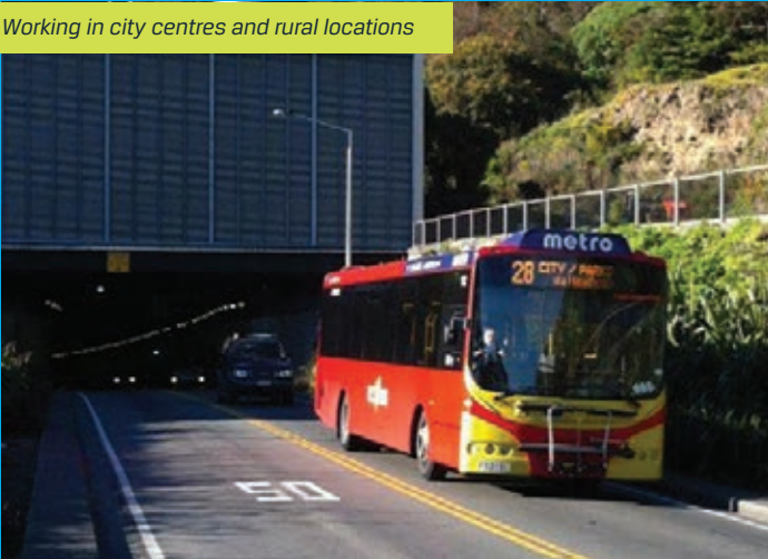
Working in city centres and rural locations

The development of our employees allows us to provide career progression opportunities and promotion from within the organisation. This results in a skilled, high performing and loyal team culture and stable workforce and industrial relations.