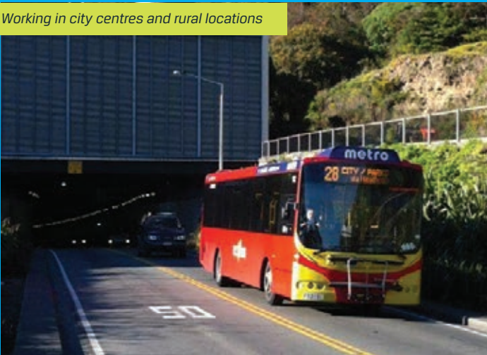
Working in city centres and rural locations

The development of our employees allows us to provide career progression opportunities and promotion from within the organisation. This results in a skilled, high performing and loyal team culture and stable workforce and industrial relations.