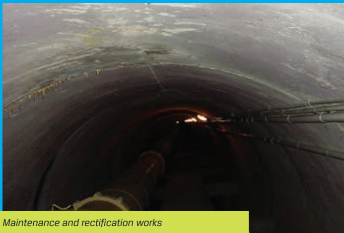
Maintenance and rectification works

We are experienced in managing the large number of stakeholders often involved in major projects and, with a strong culture of communication, have the capability to manage the various relationships effectively to ensure the project comes in on time and on budget.