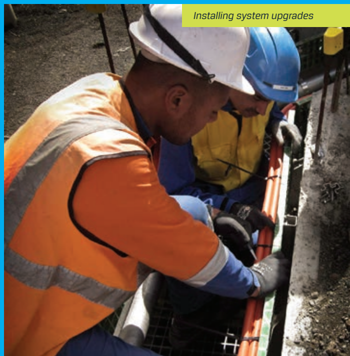
Installing system upgrades

Safety is paramount across all our operations and safety awareness is embedded in our culture. Electrix is committed to providing a safe work environment for all employees and stakeholders and our highly developed, fully accredited safety management systems are integral to all our business activities.